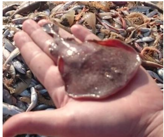
Figure 3. A photo of the neonate T. marmorata

bony fish remains, secondary crustaceans and/or cephalopods. In batoid or ray species, the main find was observed to be crustacean species, and some mollusks as their body type also suggest, but some bony fishes were also found.